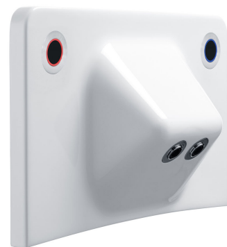
Sensors not supplied with backplate