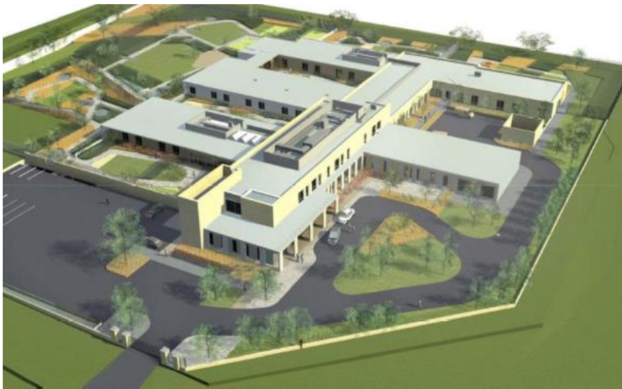
^^ Aerial view of the Department of Psychiatry

This project at Drogheda, Co. Louth, Ireland saw the construction of a new two storey structure to provide an Acute Psychiatric inpatient facility.